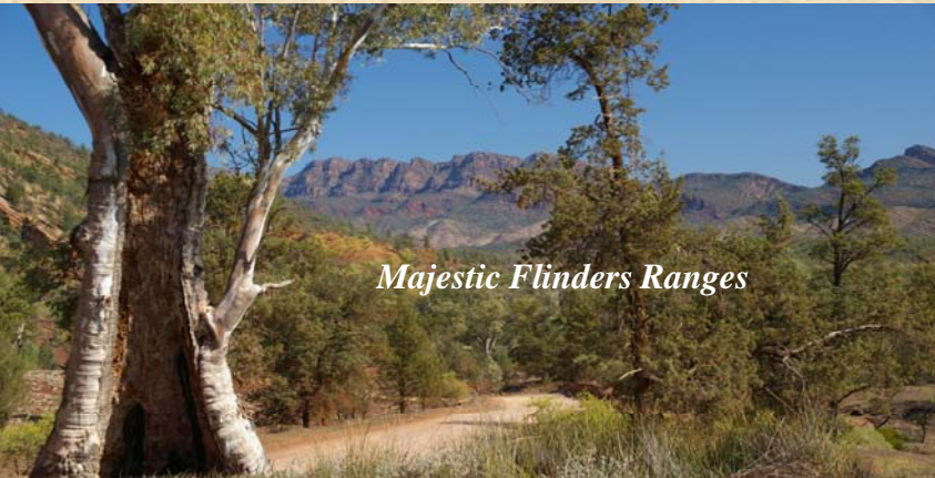
Majestic Flinders Ranges