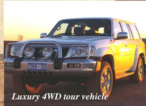
Luxury 4WD tour vehicle